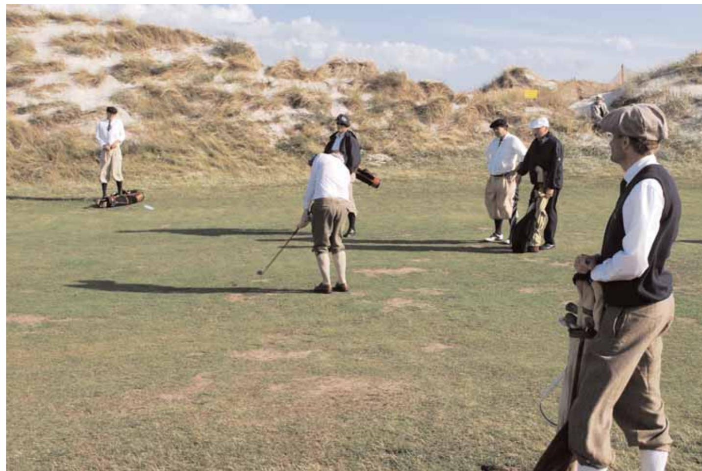
"A tolerable day, a tolerable green and a tolerable opponent..." A.J. Balfour would have enjoyed playing in the Grail match at Falsterbo.