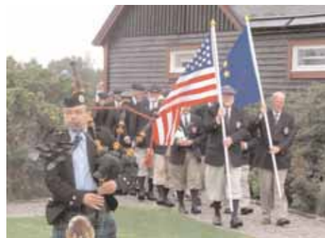
Our heroes – here they come.