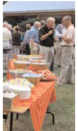
...and all of us enjoyed a week of good company.