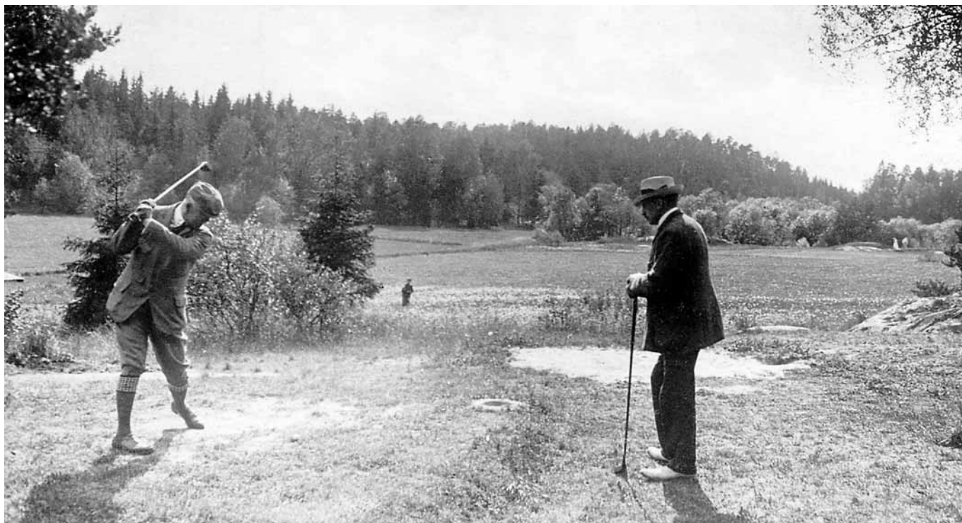
This picture from 1915 shows the second tee at the Råsunda course. This is where play will start when the course is reopened for two days in September. The green is in front of the bushes, straight ahead.