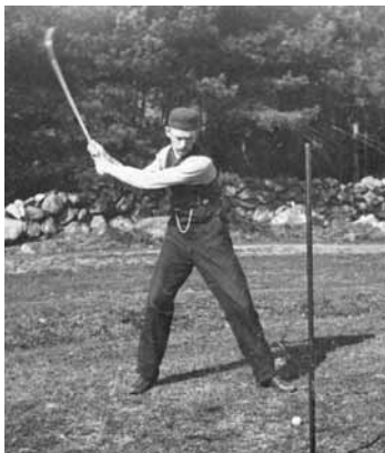
Viktor Hugo Setterberg organized early golf in Gothenburg.